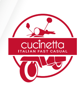
official cuisine partner